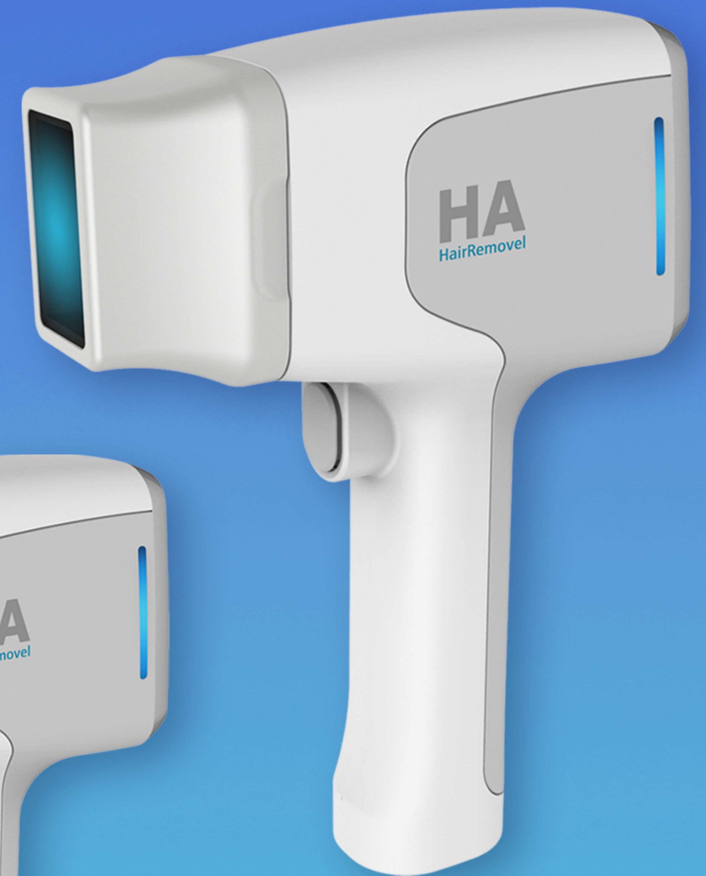
20 X 40