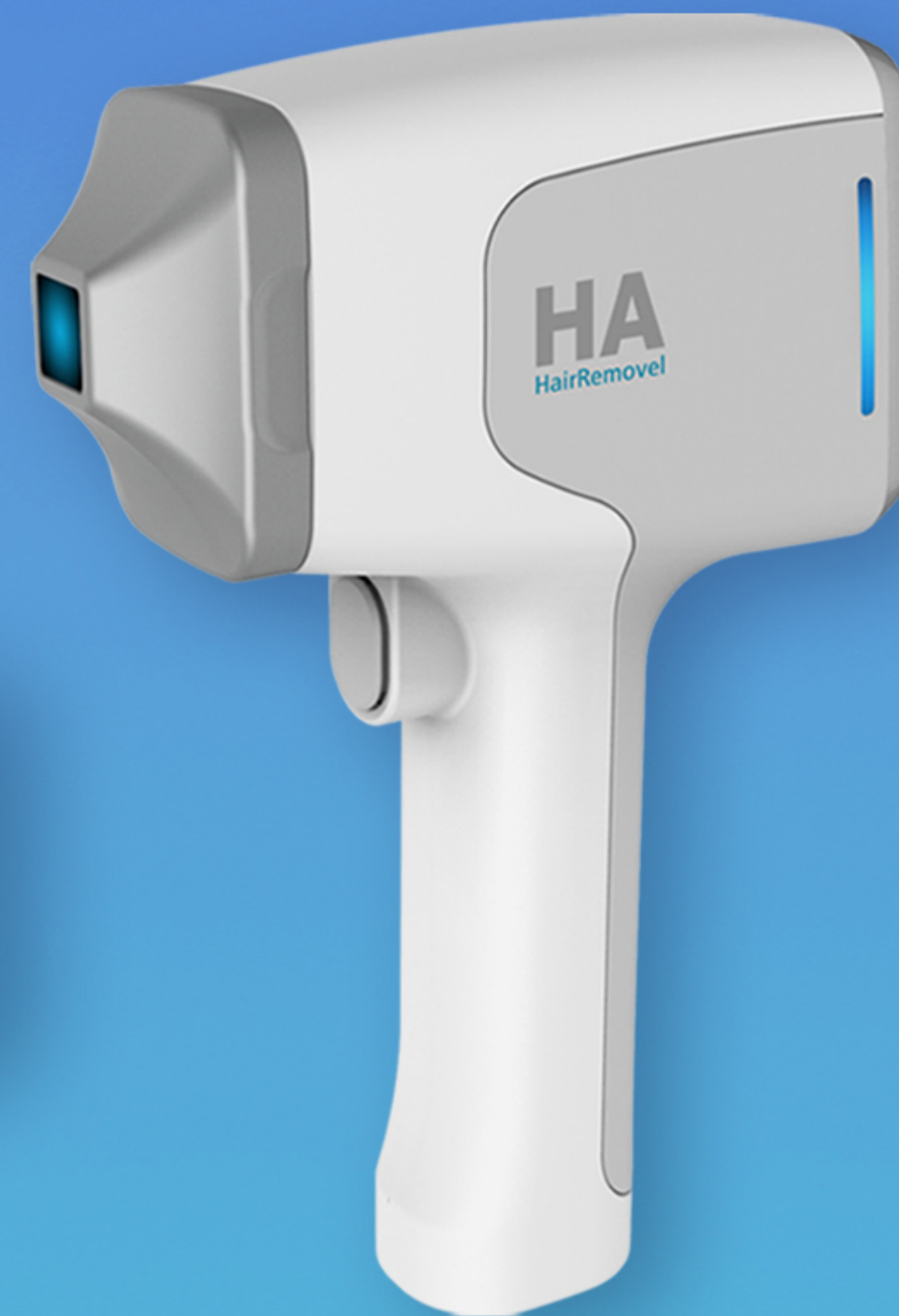
10 X 10