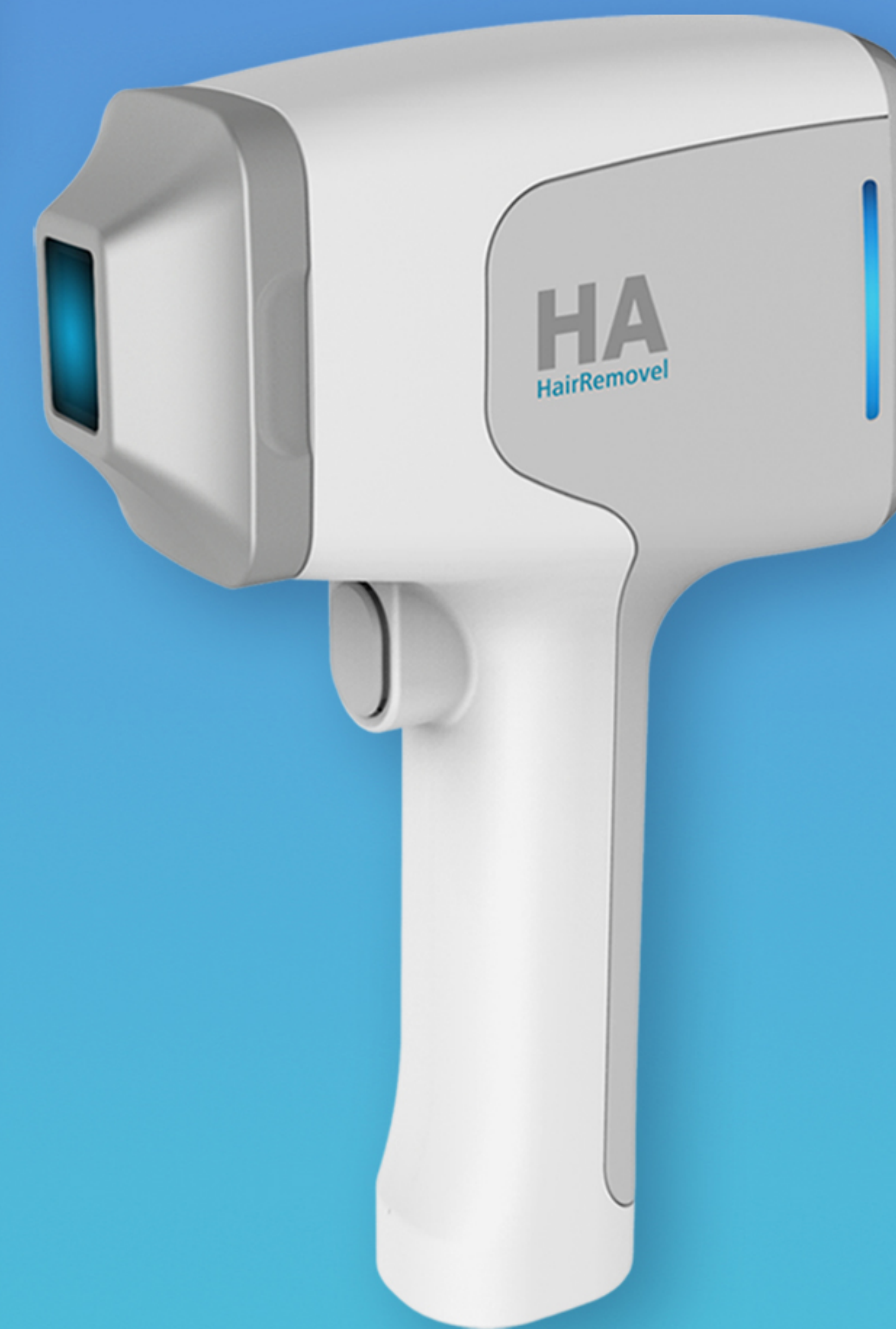
12 X 20