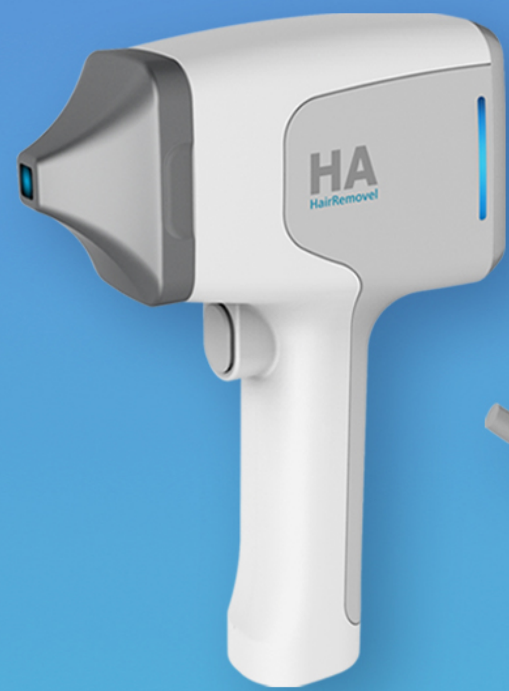
5 X 5

Handle with replaceable spot size: five spot treatment heads 20*40mm, 12*20mm, 10*10mm, 5*5mm, Ø8 nose hair removal